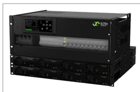
6U 500A system