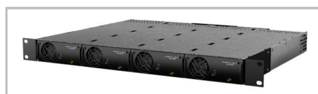
Flatpack2 universal power shelf (PN: 268035)